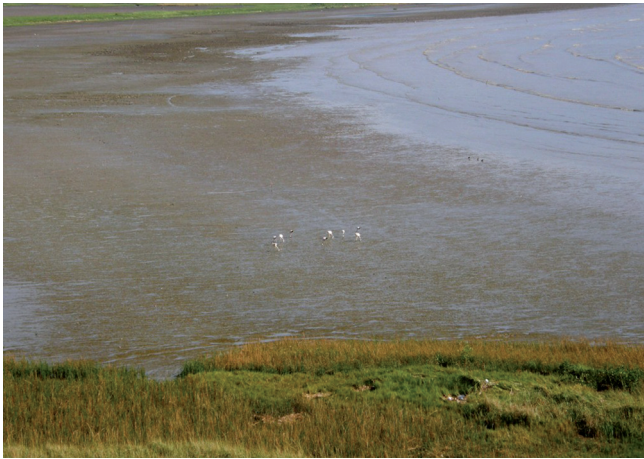
FIGURE 1: Canto dos Ganchos beach in Governador Celso Ramos, one of the places the Andean Flamingo was recorded. Note the extensive mud beach formed at the intertidal zone and the presence of some flamingos.