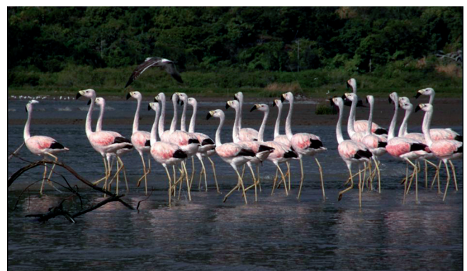
FIGURE 3: Andean Flamingos at Canto dos Ganchos beach, Governador Celso Ramos.

Most residents stated that the flamingos were always at Canto dos Ganchos. One resident of 60 years stated that flamingos were always in the region during the southern winter and that, in the past, flocks were larger than they are today. Also, flamingos were not infrequently hunted as food. Another resident, living in the area for 15 years, stated that he often saw the flamingos, occasionally near his house. Residents observed that occasionally the flamingos disappear from the region, but never for long time intervals. Also, residents stated that flamingos