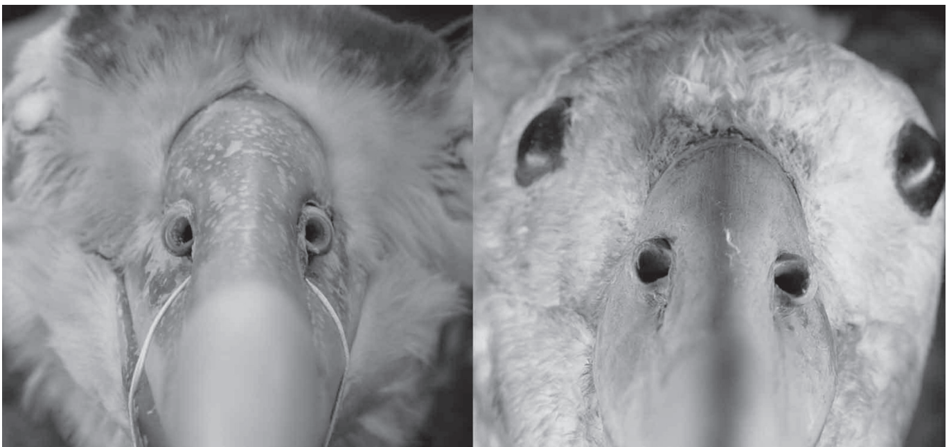
FIGURE 1. Frontal head view of specimens MZUSP 76455, Diomedea exulans (left), MZUSP 16098 D. epomophora (right). Note shape of the nostril openings, elliptic in D. exulans and circular in D. epomophora.

A Diomedea specimen (MZUSP 16098; taken off the Arcatrazes archipelago, São Paulo; Appendix), was identified by Pinto (1938) as D. epomophora longirostris Mathews, 1934 (= D. epomophora ), and by Grantsau (1995) as Diomedea exulans exulans (= D. exulans ). After re-examining the MZUSP specimen, we confirm this as being D. epomophora . This result was based on the form of the nostril openings (elliptic in D. exulans [ lato sensu ] and circular in D. epomophora and D. sanfordi ; figure 1), and the presence of a conspicuous black line along the cutting edge of the upper maxilla (figure 2). These characters are considered diagnostic of both species of Royal Albatrosses (Murphy 1936, Marchant and Higgins 1990). Furthermore, the specimen in question has white upper-wing coverts, hence excluding D. sanfordi , wherein the upperwing is entirely black (Harrison 1985, Marchant and Higgins 1990, Brooke 2004). This latter species is known in Brazil from only two records (Olmos 2002b, Carlos et al. 2004).