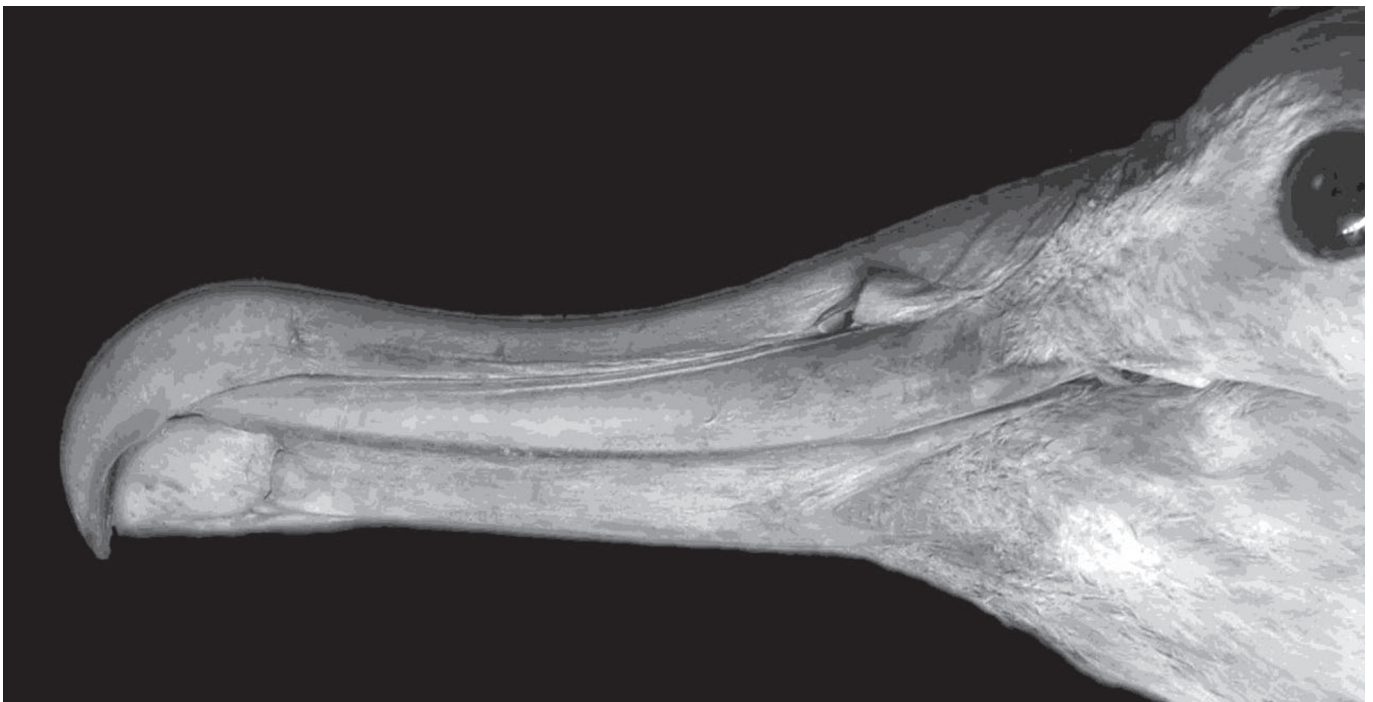
FIGURE 2. Lateral bill view of specimen MZUSP 16098, Diomedea epomophora . Note dark line along cutting edge of upper maxilla.

Assuming the specimen in question is a Thalassarche , the bill length suggests it could not be assigned to the small-sized mollymawks occurring in the Atlantic Ocean (Marchant and Higgins 1990, del Hoyo et al. 1992): Black-browed T. melanophris , Grey-headed T. chrysostoma (Foster, 1785), and Atlantic Yellow-nosed Albatrosses T. chlororhynchos (Gmelin, 1789). Bill length of the MOVI skull places it within the known range for the species of the “Shy Albatross complex”: Shy T. cauta (Gould, 1841), White-capped T. steadi (Falla, 1933), Salvin’s T. salvini (Rothschild, 1893) and Chatham Albatross T. eremita (Murphy, 1930) (Murphy 1936, Marchant and Higgins 1990, Double et al. 2003; table 1). There are several records of “Shy Albatrosses”, most immatures of undetermined species, in south-western Atlantic, but only T. steadi and T. salvini have been confirmed (Marchant and Higgins 1990, Phalan et al. 2004). The identity of the two Brazilian specimens, identified as “ Diomedea cauta cauta ” (Petry et al. 1991, Grantsau 1995, Lima et al. 2004) should be investigated.